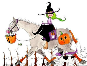
Horses are the treat. (Riding is the trick.)

Meeting at the Community Bldg 6:00 PM Education 7:00 PM General